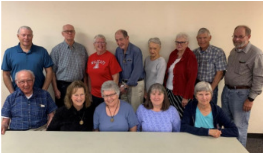
Tucson Paulist Associates (March 7, 2020):

Yes, the Tucson Paulist Associates continue to live and spread the vision and mission of Servant of God Isaac Hecker and the Paulist Fathers.