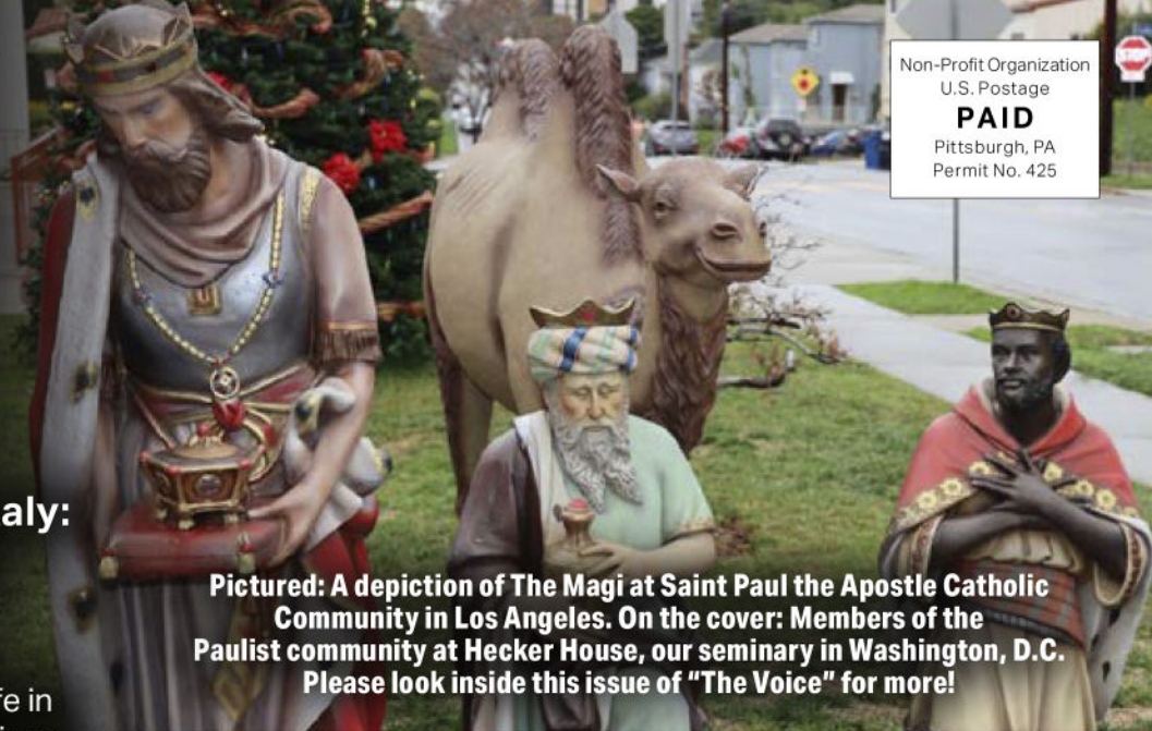
Pictured: A depiction of The Magi at Saint Paul the Apostle Catholic Community in Los Angeles. On the cover: Members of the Paulist community at Hecker House, our seminary in Washington, D.C. Please look inside this issue of "The Voice" for more!

(212) 586-2074 • paulist.org • @PaulistFathers