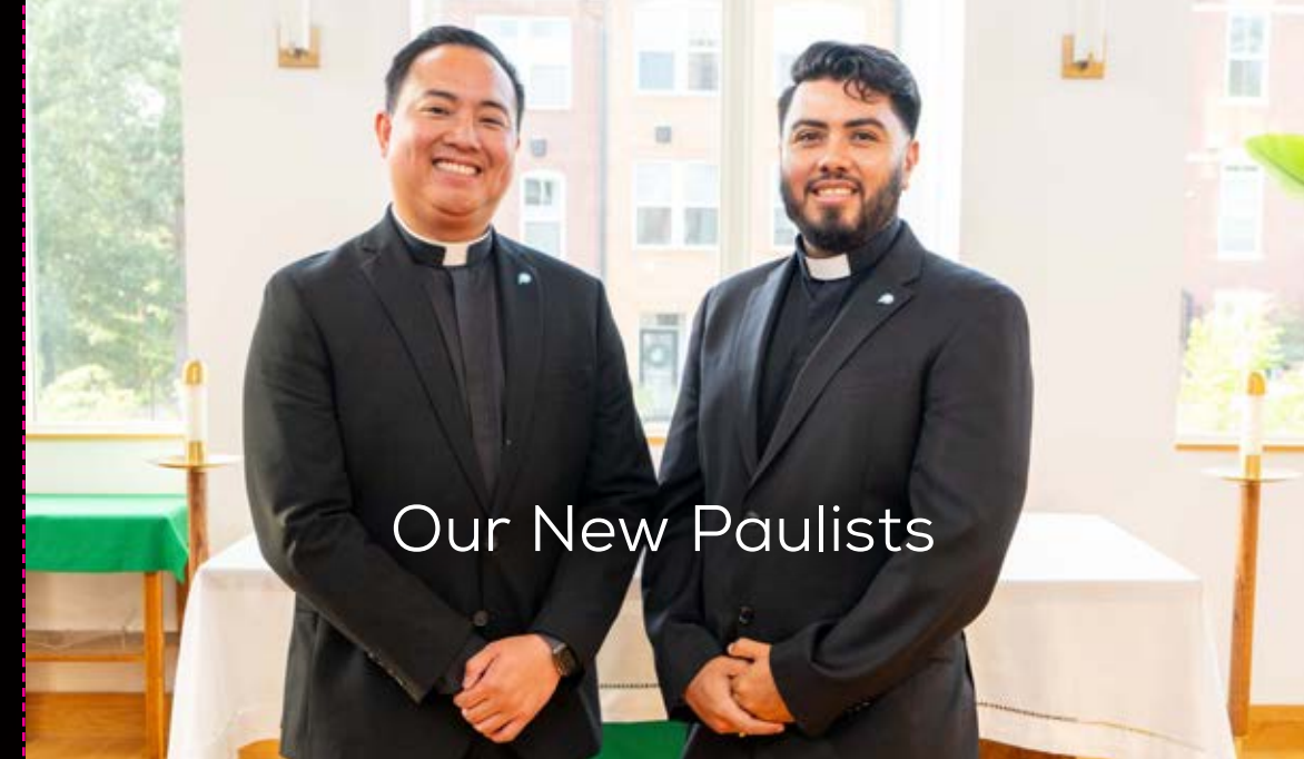
Our New Paulists