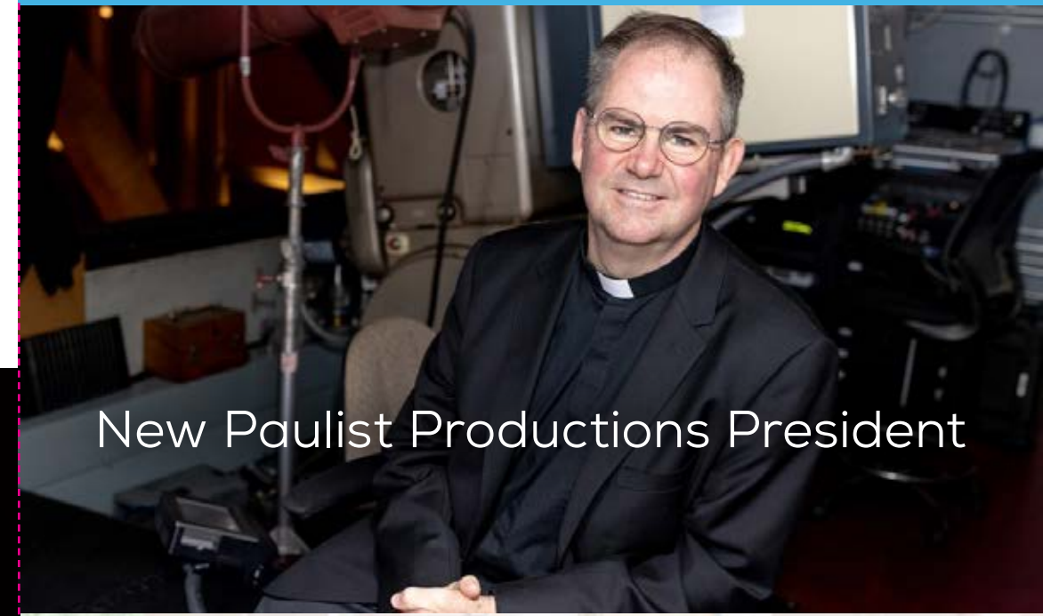
New Paulist Productions President

News from The Paulist Fathers Office of Mission Advancement